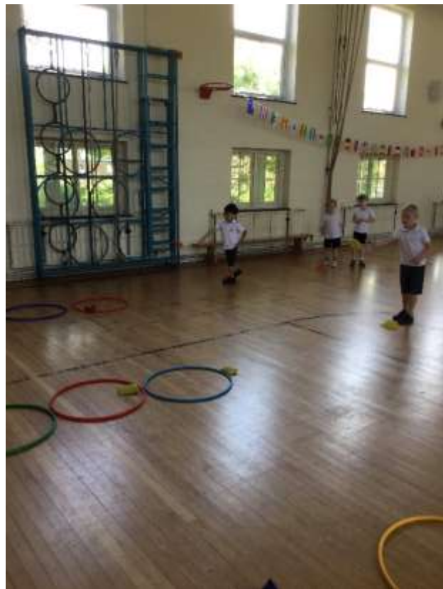
(Foundation pupils enjoying P.E. in the school gymnasium)