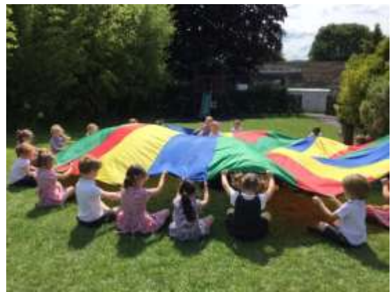
(Reception Classroom and outside play)