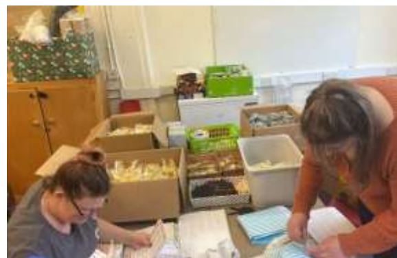
The team working hard stuffing envelopes!